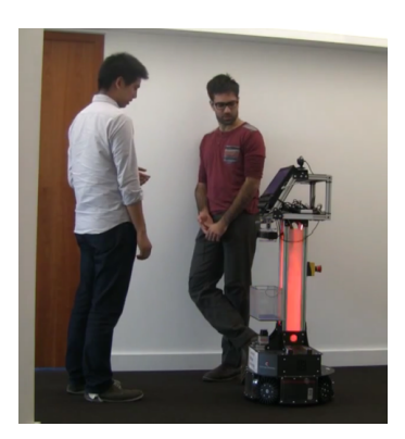
(b) Flashing red light for path obstructions